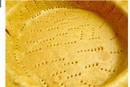
Roll out the dough