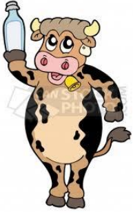
20 cl milk