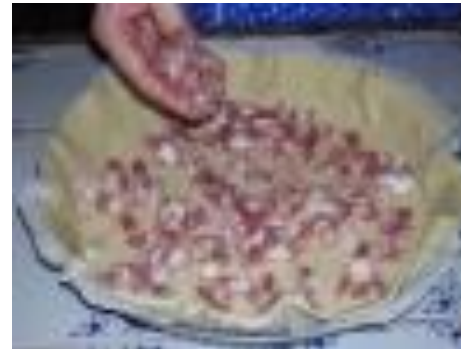
Put the lardons