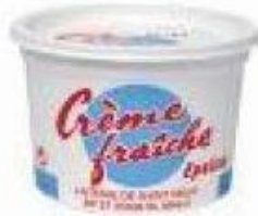
15 cl fresh cream