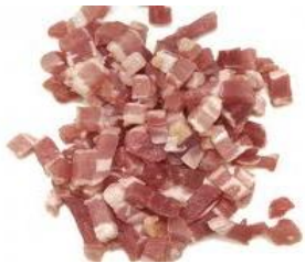
220 g lardons