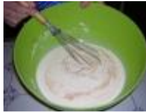
Mix all the ingredients together