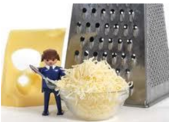
125 g grated cheese