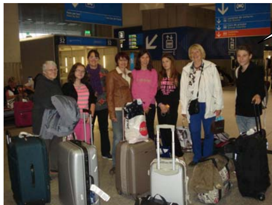
Arrival in Roissy with the delegation