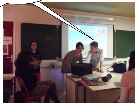
Dissemination of the project in my class

One of the elements I particularly enjoyed in this trip is that it has been a unique opportunity for me to meet with students from 4 different countries. I realised how much we are at the same time very similar but also very different. We do not see things the same way. It was very enriching for me. It has been very apparent in the presentations which were treating the same subject from totally different angles depending on the country.